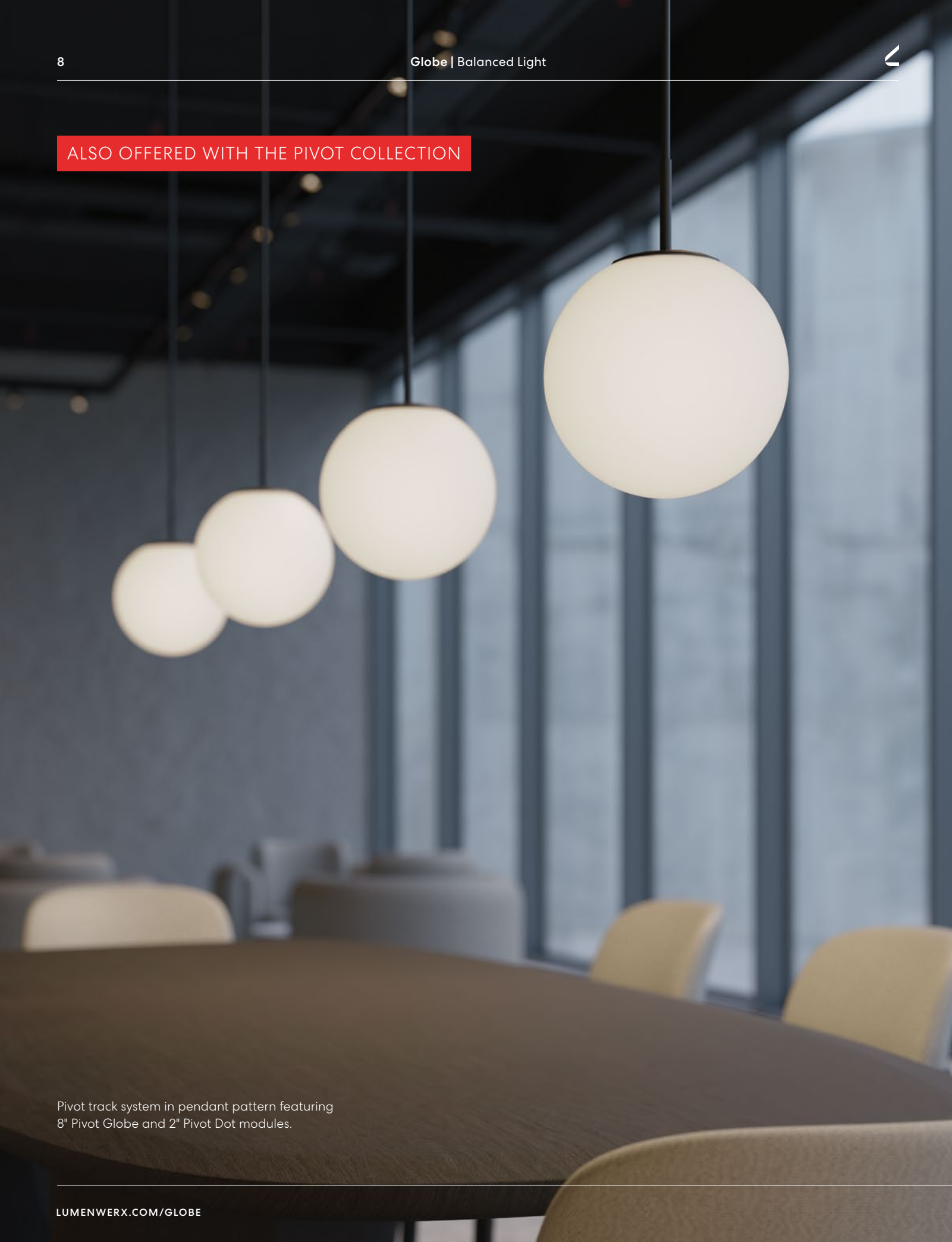
Pivot track system in pendant pattern featuring 8" Pivot Globe and 2" Pivot Dot modules.