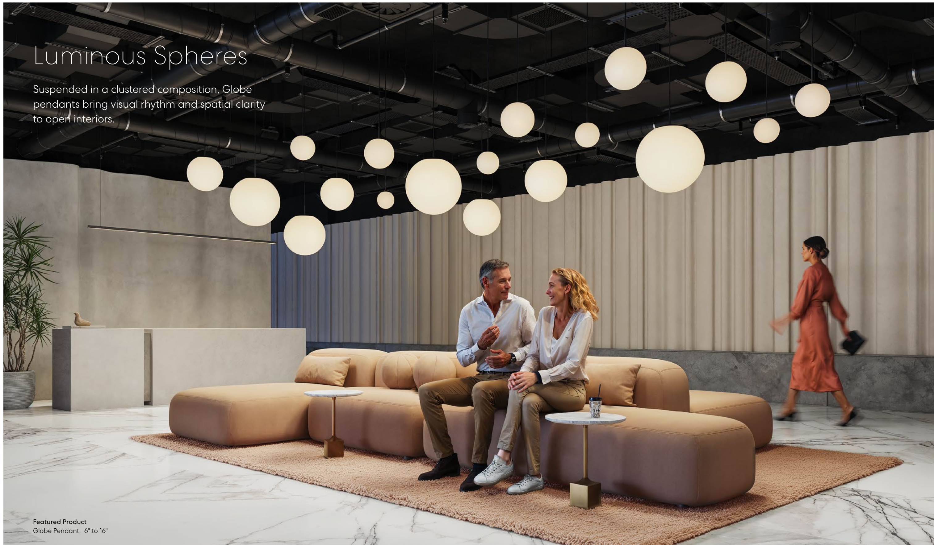
Featured Product Globe Pendant, 6" to 16"

Suspended in a clustered composition, Globe pendants bring visual rhythm and spatial clarity to open interiors.