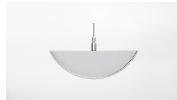
Fixed Cable - Adjustable gripper cable mounts at modular locations for continuous runs