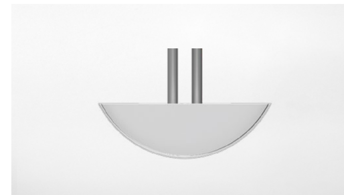
Double Stems - Two 0.375" diameter stems provide a distinctive mounting detail