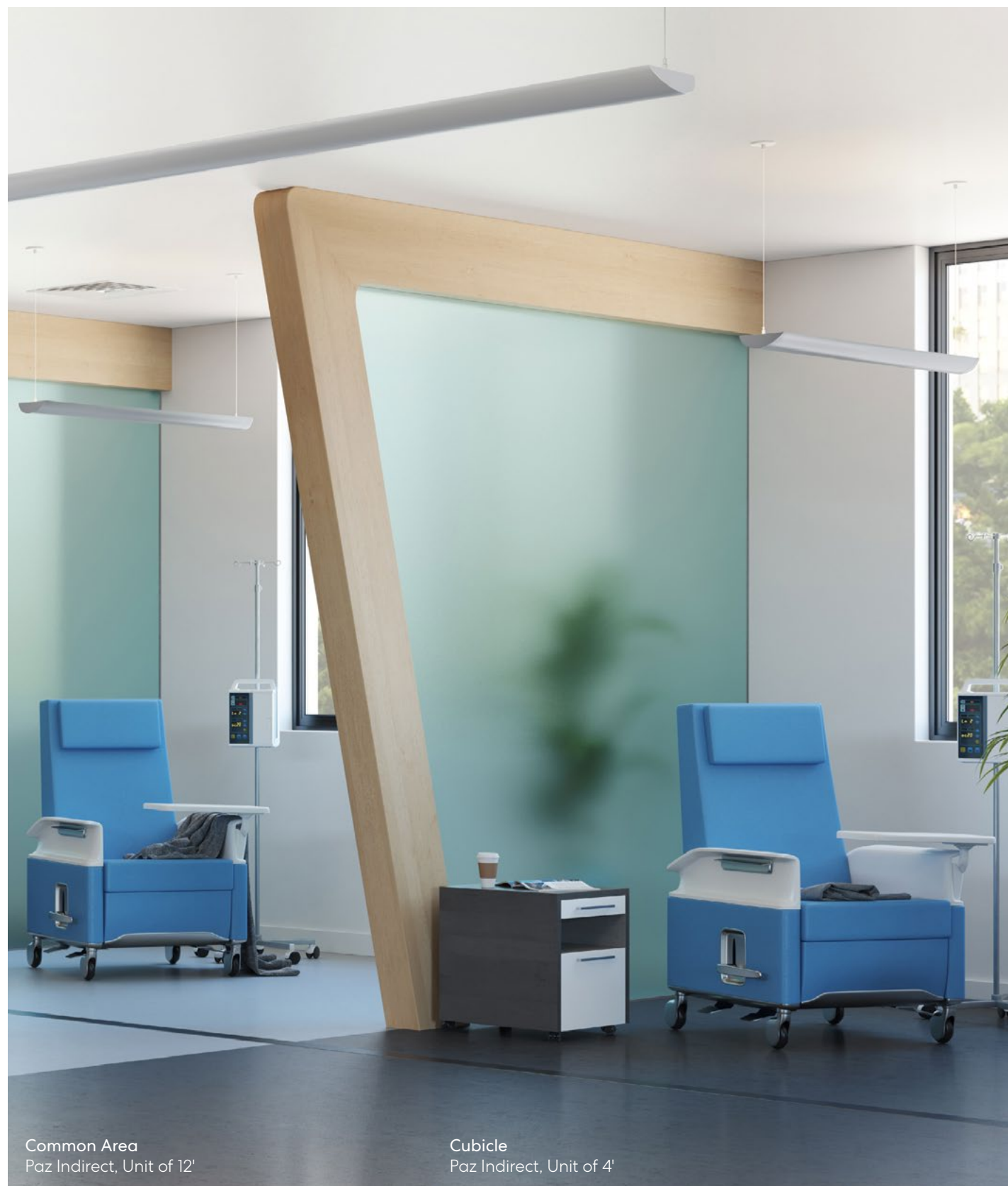
Common Area Paz Indirect, Unit of 12'