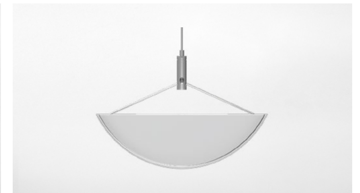
Sliding Cable - Yoke mounted cable slides to accommodate irregular mounting locations