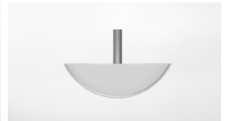
Single Stem - 0.5" diameter stem mounts at modular locations for continuous runs